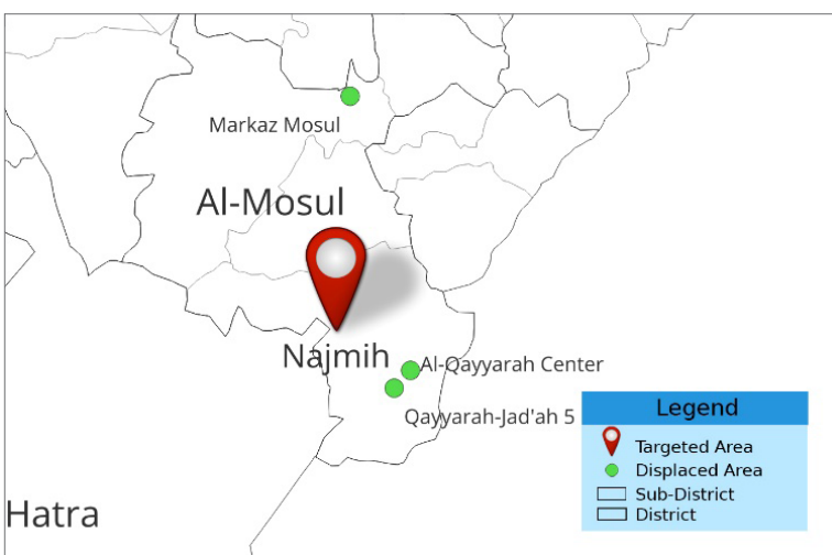
Figure 2: Najma Map